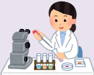
Lab technician @microbial laboratory

Start of Gram stain and report of results